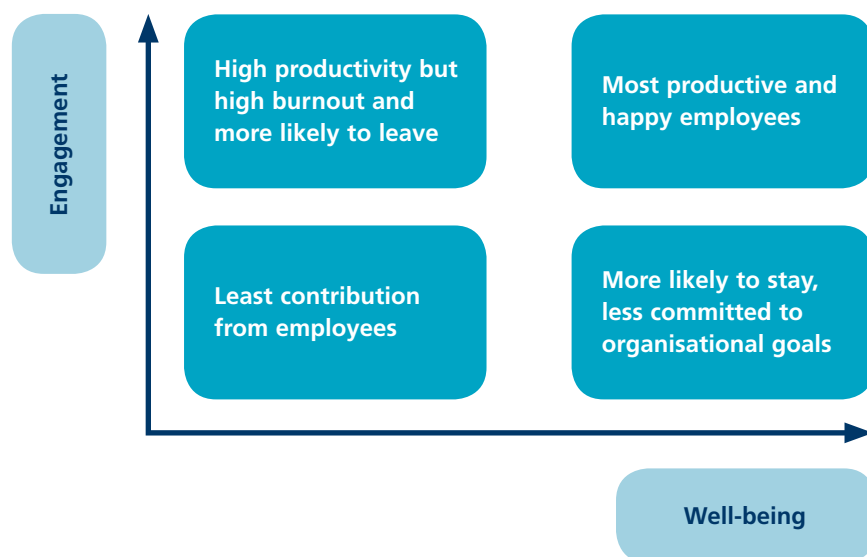
Figure 1: The interaction between employee engagement and well-being

Although research exploring the beneficial impact psychological well-being can have on employee engagement is limited, both factors have been shown to be of benefit to organisational outcomes. Robertson and Cooper (2010) therefore suggest it is feasible that the combined impact of engagement and well-being may be greater than each one alone.